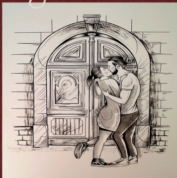
I Believe in Love | 2025