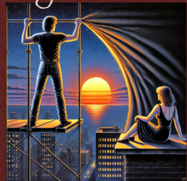
Goodbye Stand | 2025