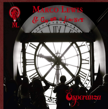
Esperanza | 2019