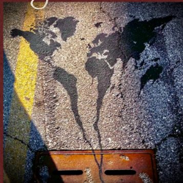
Brooklyn's Wall | 2021